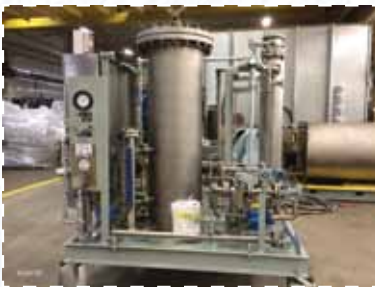
Ex: Stainless and Carbon Steel heated system with Pre-filter. Explosion-Proof with purged electrical enclosure and transmitters. 2014

HILCO's Engineers will analyze your requirements and design systems according to your needs. From the smallest Single-Cartridge Vessel to the most complex Coalescer system. Our lab can evaluate customer samples and recommend performance level and features required.