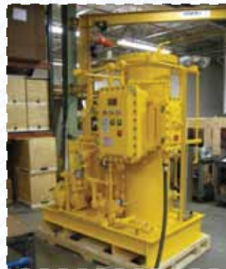
Ex: Portable, Carbon steel heated system with 2 Pre-filters. Explosion-Proof; rated for Group B (Hydrogen) atmosphere. 2008